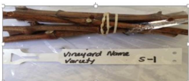
Fig 3: Composite cane sample