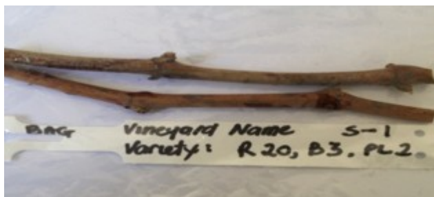
Fig 2: Single cane sample